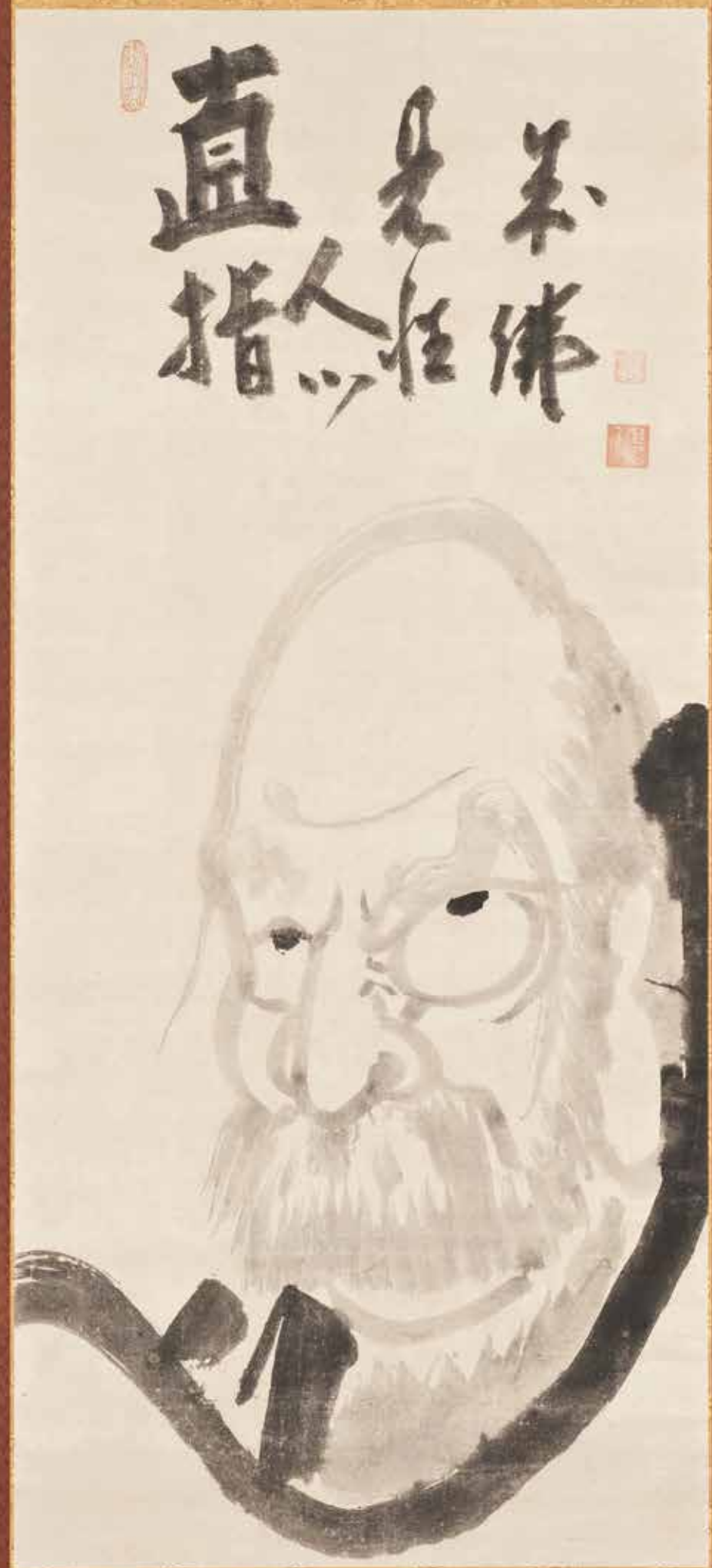
Bodhidharma, first Zen ancestor.